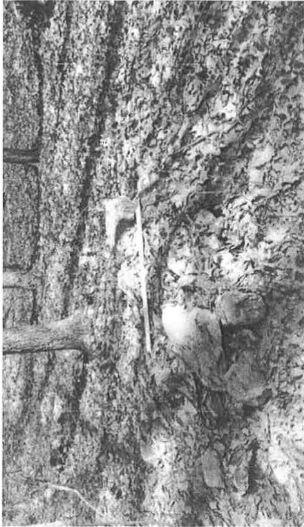
Photo - 2015 - provided by Anne Santoro Area in/around Ancient Highway, East Lyme, CT