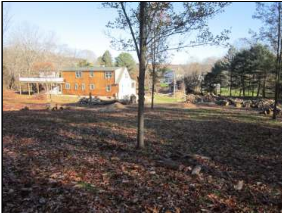
Fig. 3 View facing north over Lot 4 toward existing structure on Lot 3