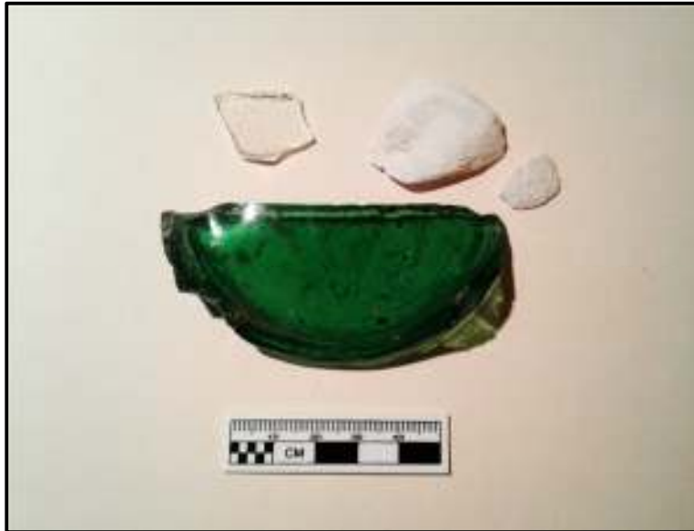
Fig 2 Artifacts from STP T5-0 included green bottle glass base fragment, clear curved glass bottle fragment and two shell retrieved from A horizon at 15-25 cmbs