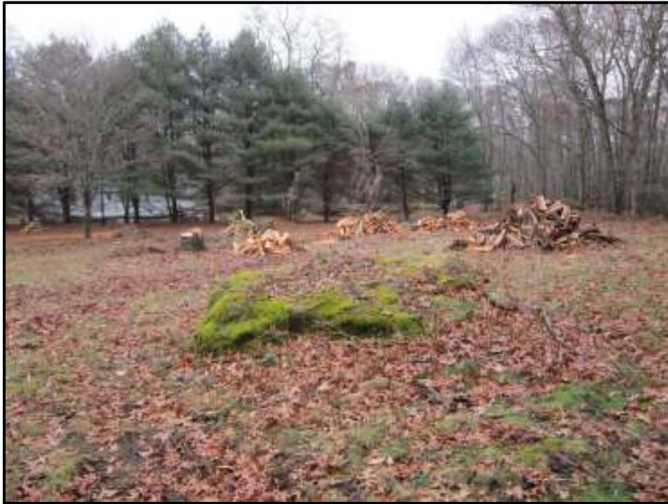
Fig. 6 View facing east over Lot 4