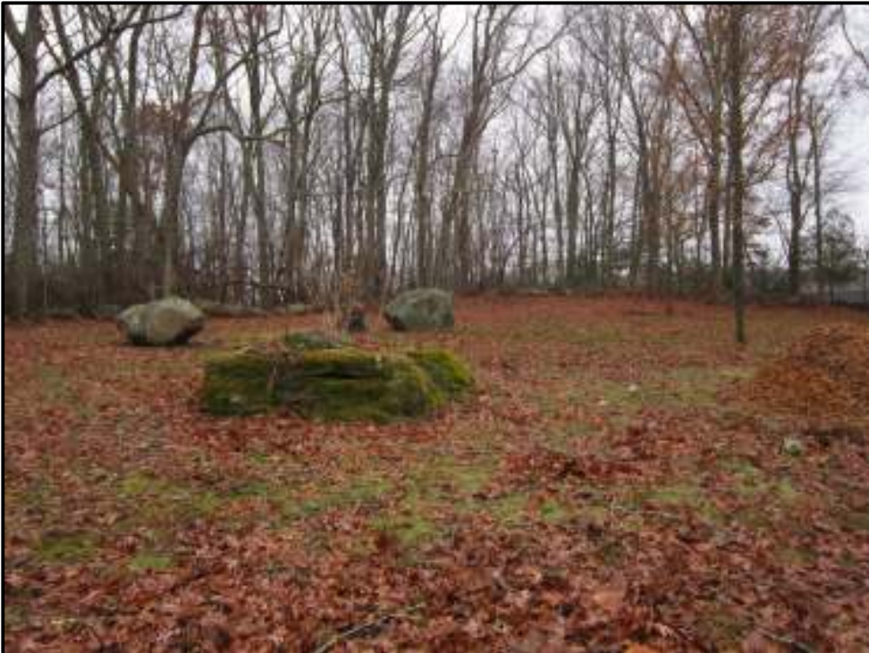
Fig 5. View facing south west over Lot 4