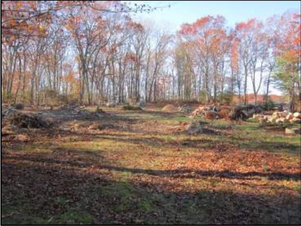
Fig. 4 View facing southwest on Lot 4