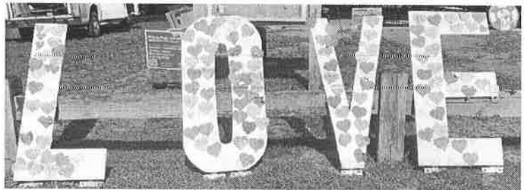
Out of the Darkness Walk McCook Point Park

Youth Services collaborates with the schools, police, and other local and state agencies. These strong relationships are essential in increasing public awareness, education, and access to resources focusing on mental health, substance use, and prevention, resulting in better health and improved quality of life in East Lyme.