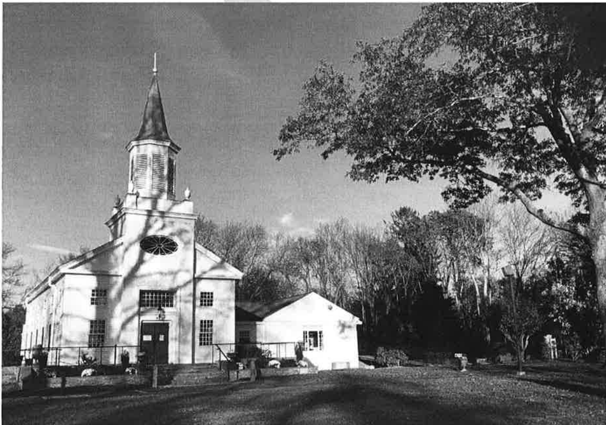
St. Ann's Episcopal Parish