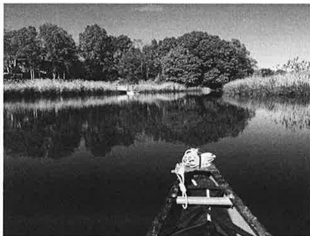
Lieutenant River

Only pre-existing lots with accepted building plans that are already identified can be added to the sewer project. Clean water Funds do not allow economic development such as increasing density of use or adding new homes to previously non-buildable lots. Individual beach communities WPCA's will be responsible for enforcing the stipulations of the clean water funding for the sewer and water project.