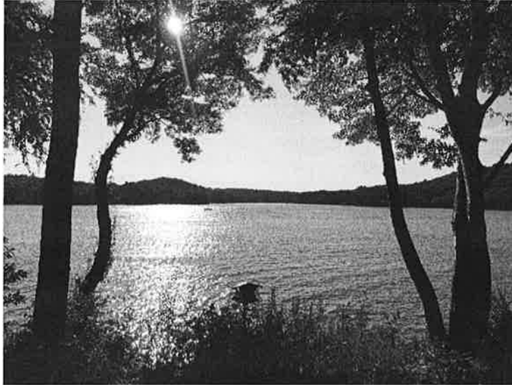
Rogers Lake