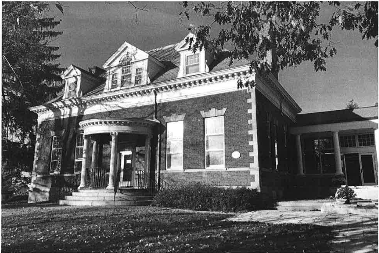
Phoebe Griffin Noyes Library