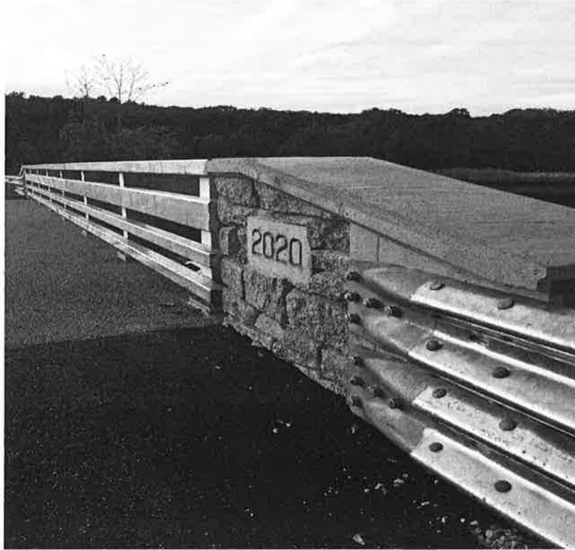
Mile Creek Bridge